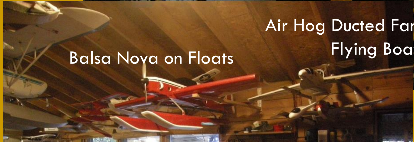
Balsa Nova on Floats