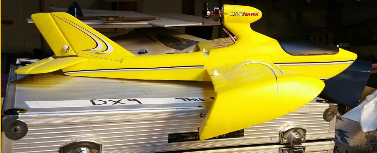
For a small plane, this little highly modified Plane is great in the wind and Very spirited !!