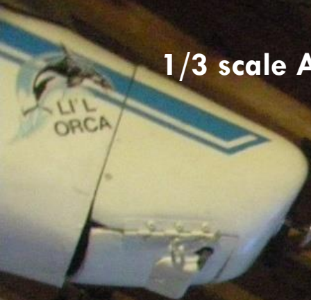
1/3 scale Aeronca on floats