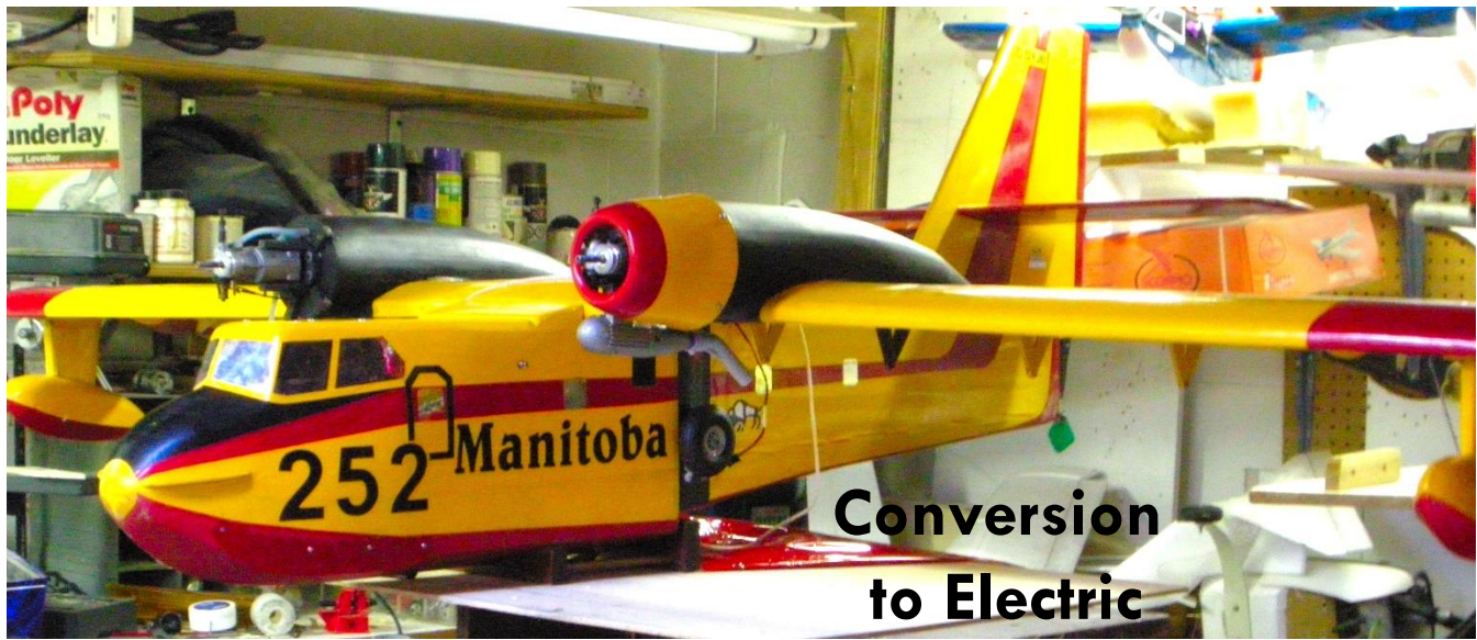
Conversion to Electric