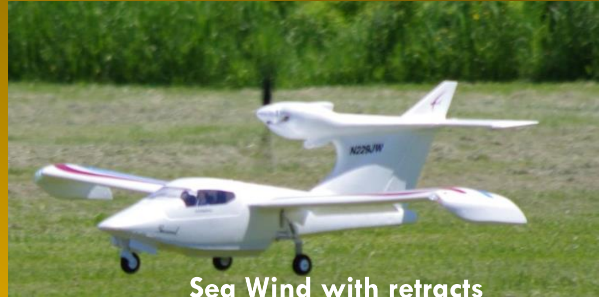
Sea Wind with retracts Another amazing flyer