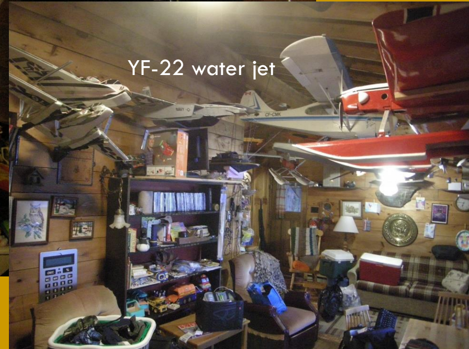
YF-22 water jet