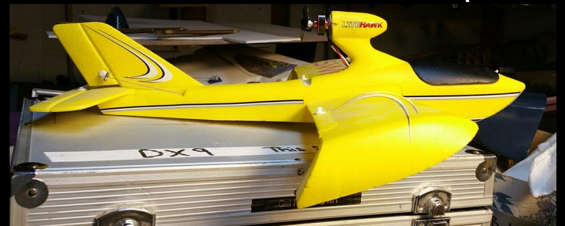
Extensive Modification Flitehawk mini sea plane