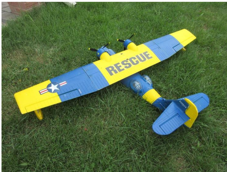
Second Catalina first one burnt in fire