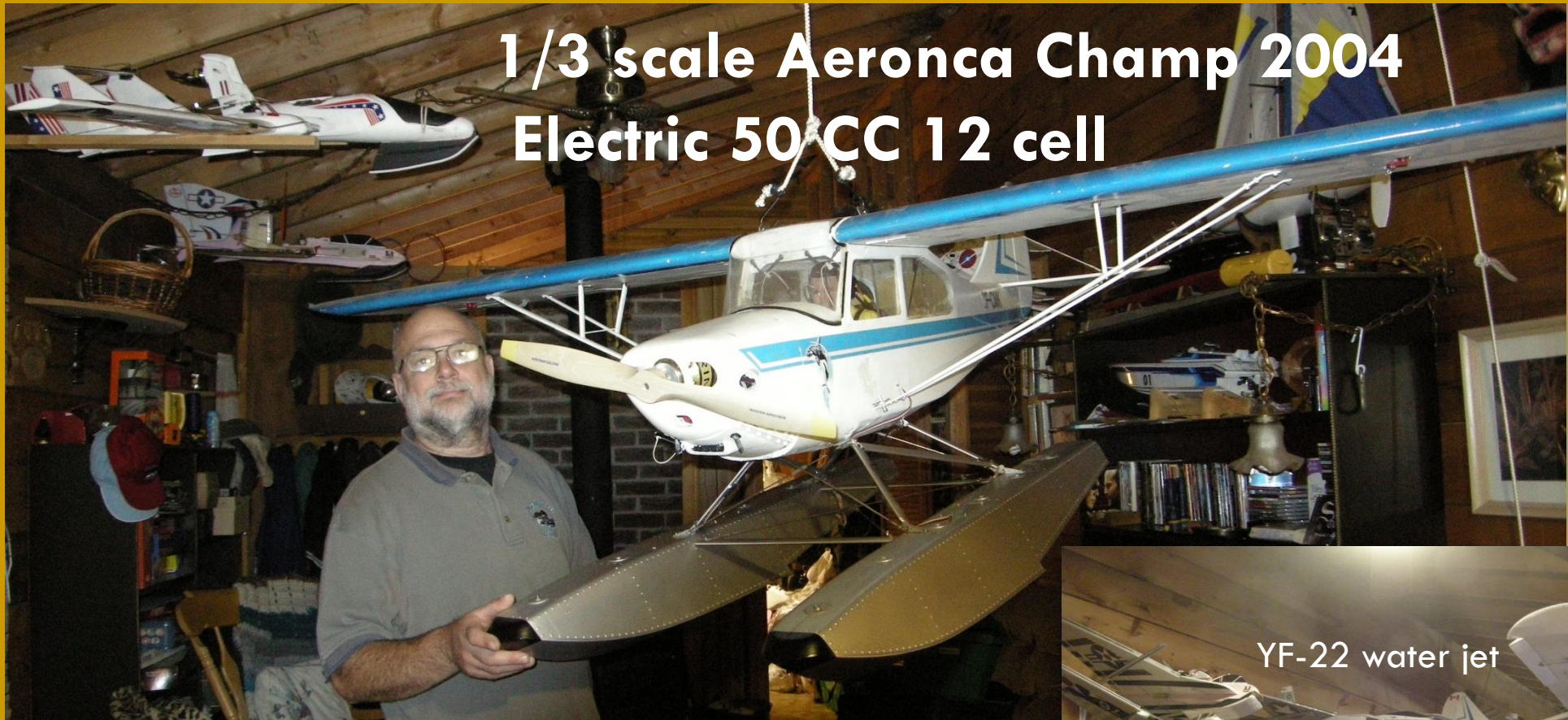
1/3 scale Aeronca Champ 2004 Electric 50 CC 12 cell

25 Planes Lost in Cottage Fire of 6/2015