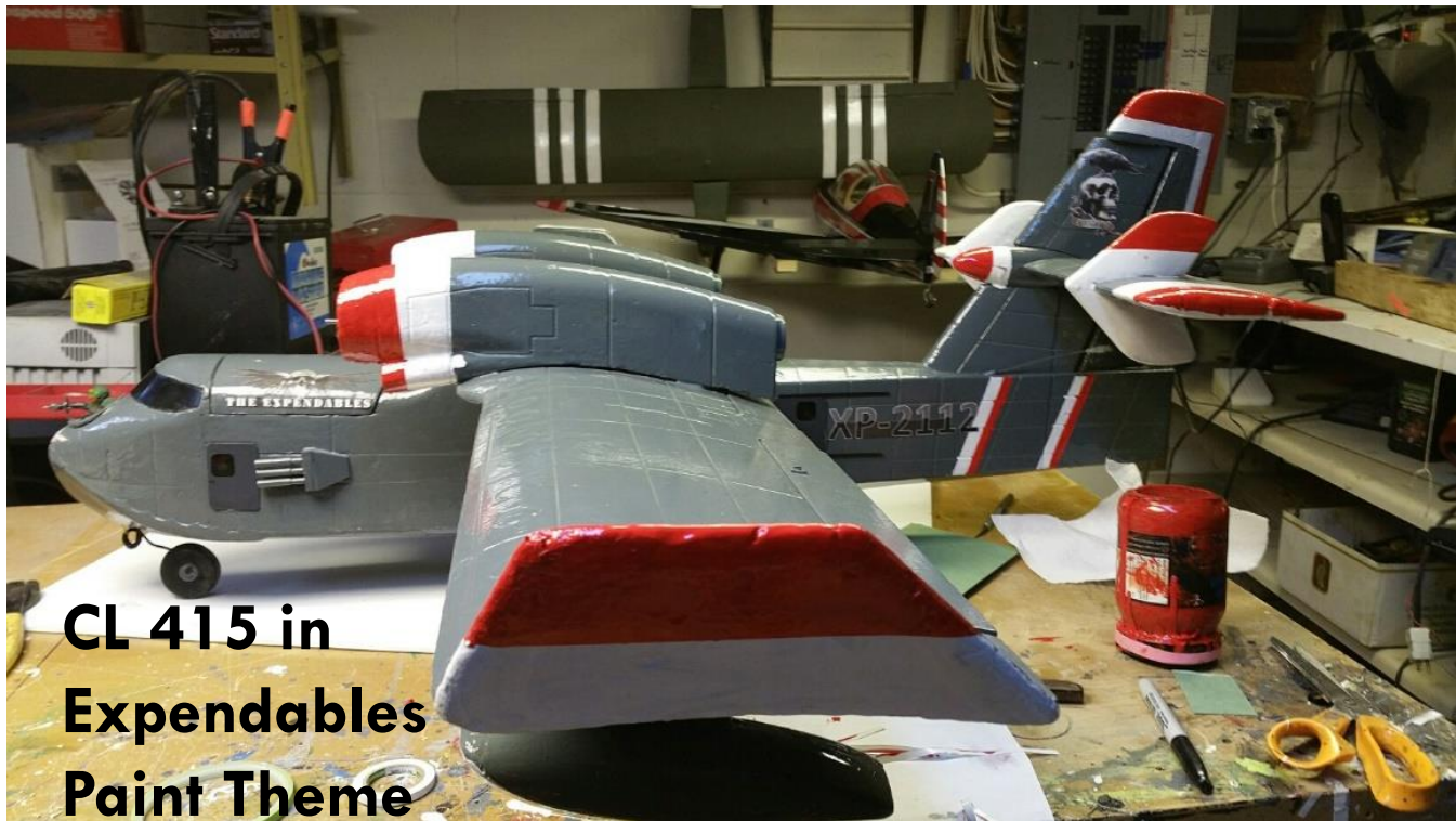
CL 415 in Expendables Paint Theme