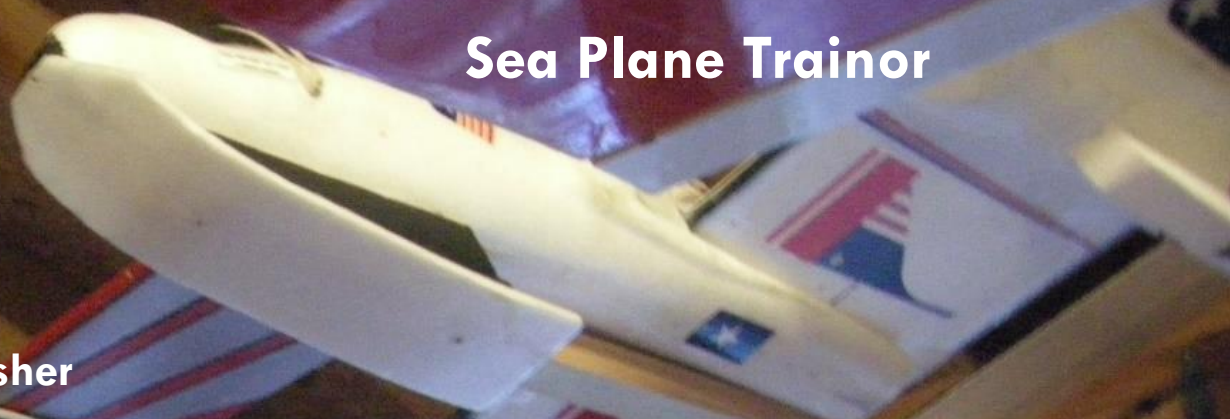
Sea Plane Trainor