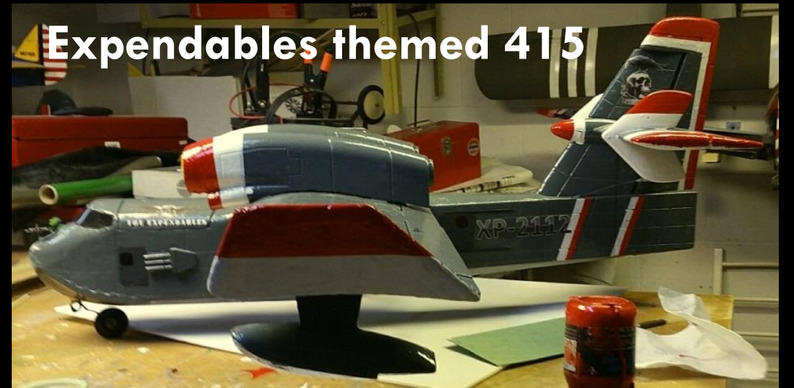
Expendables themed 415