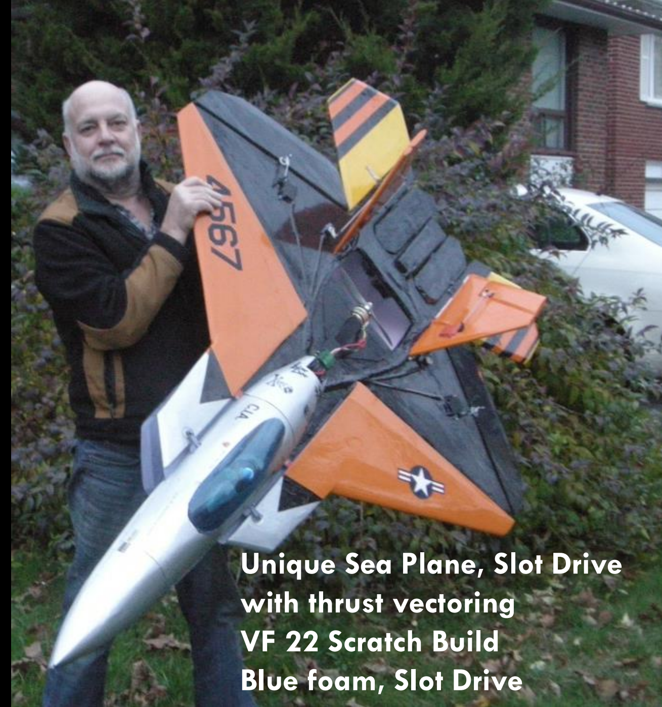
Unique Sea Plane, Slot Drive with thrust vectoring VF 22 Scratch Build Blue foam, Slot Drive